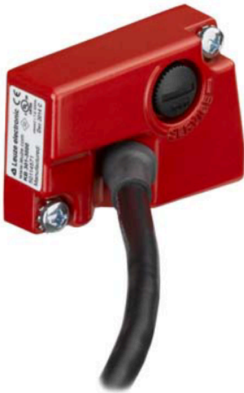
Part no.: 50126132 KB 307-3000 Interconnection cable